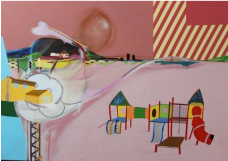
'SUBURBAN PLAYGROUND' 160CM X 120CM MIXED MEDIA PAINTING ON CANVAS 2015