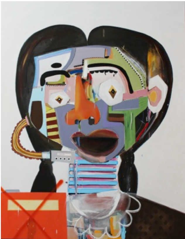
'PIYA' 165CM X 125CM MIXED MEDIA PAINTING ON CANVAS 2015