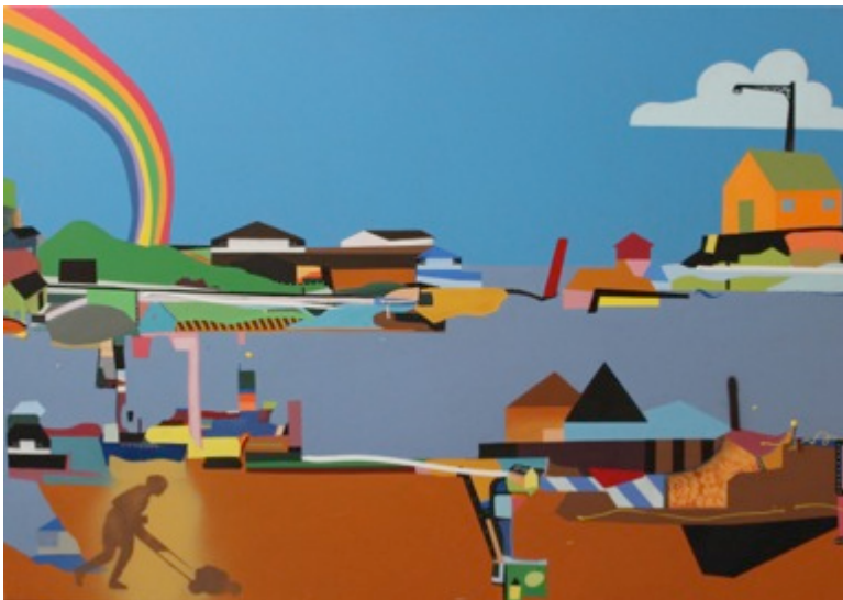
'HOLIDAY HOUSE' 140CM X 100CM MIXED MEDIA PAINTING ON CANVAS 2015