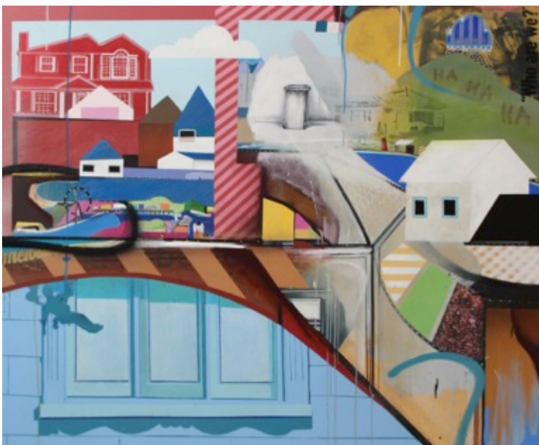
'SUBURBAN WINDOW IN (EMPTY NURSERY BLUE)' 145CM X 120CM MIXED MEDIA PAINTING ON CANVAS 2015