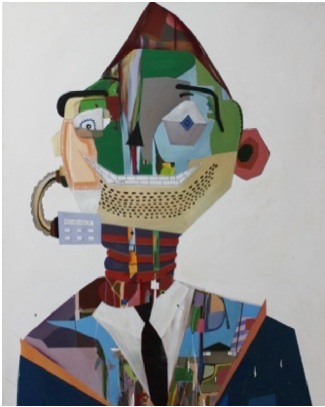
'SELF PORTRAIT AS SUBURBAN ROBOT' 150CM X 120CM MIXED MEDIA PAINTING ON CANVAS 2015