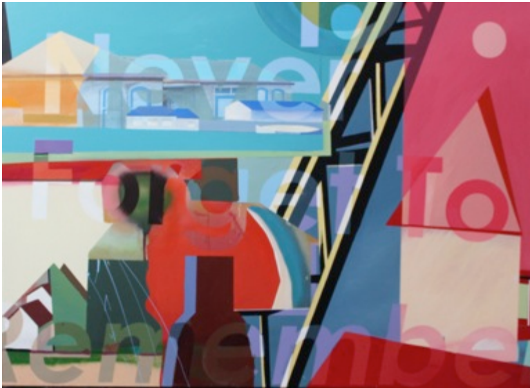
'SUBURBAN MYTH' 165CM X 120CM MIXED MEDIA PAINTING ON CANVAS 2015