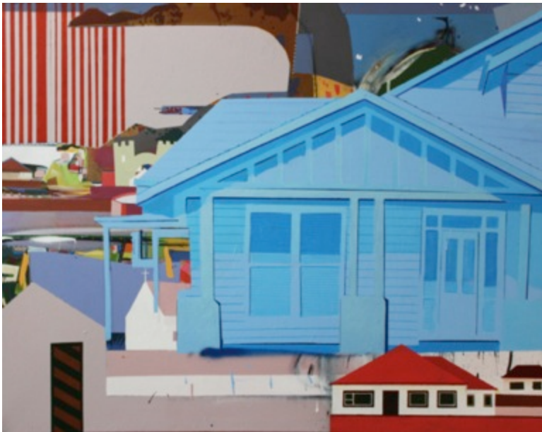
'CODE BLUE (EMPTY NURSERY BLUE)' 150CM X 120CM MIXED MEDIA PAINTING ON CANVAS 2015