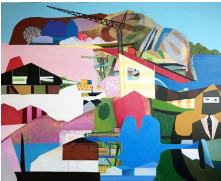
'NEVER FORGET TO REMEMBER' 180CM X 135CM MIXED MEDIA PAINTING ON CANVAS 2015